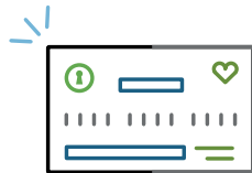
View your benefit card